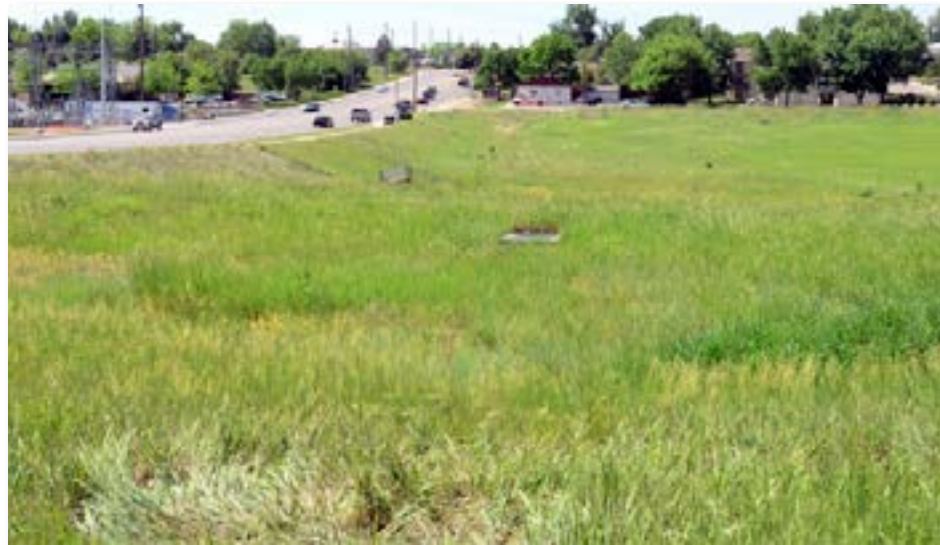
The vegetated sand filter at Belmar Park blends into the landscape leaving the outlet structure as the only recognizable feature of this BMP.

This 10 year old water quality basin was designed per USDCM sand filter criteria, however, a 6-inch top layer of sandy loam was added and the basin was seeded. It treats stormwater from a tributary that's in excess of 6 areas. The City reports that maintenance to date has consisted of debris removal.