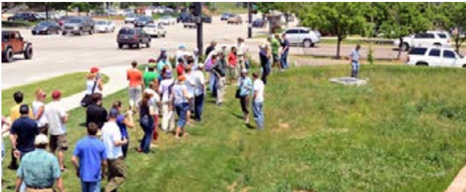
Rain garden at the entrance to the Douglas County Sheriffs' Substation.

Another rain garden in an urban setting—with a deck bisecting the garden, this design is a great example of making the facility an amenity.