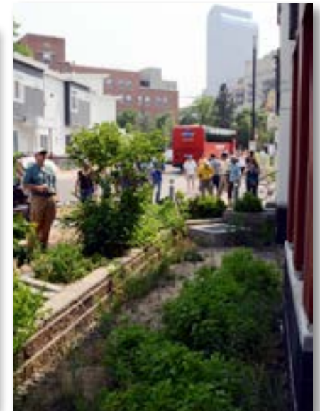
Rain Garden at the Park Ave. DHA site