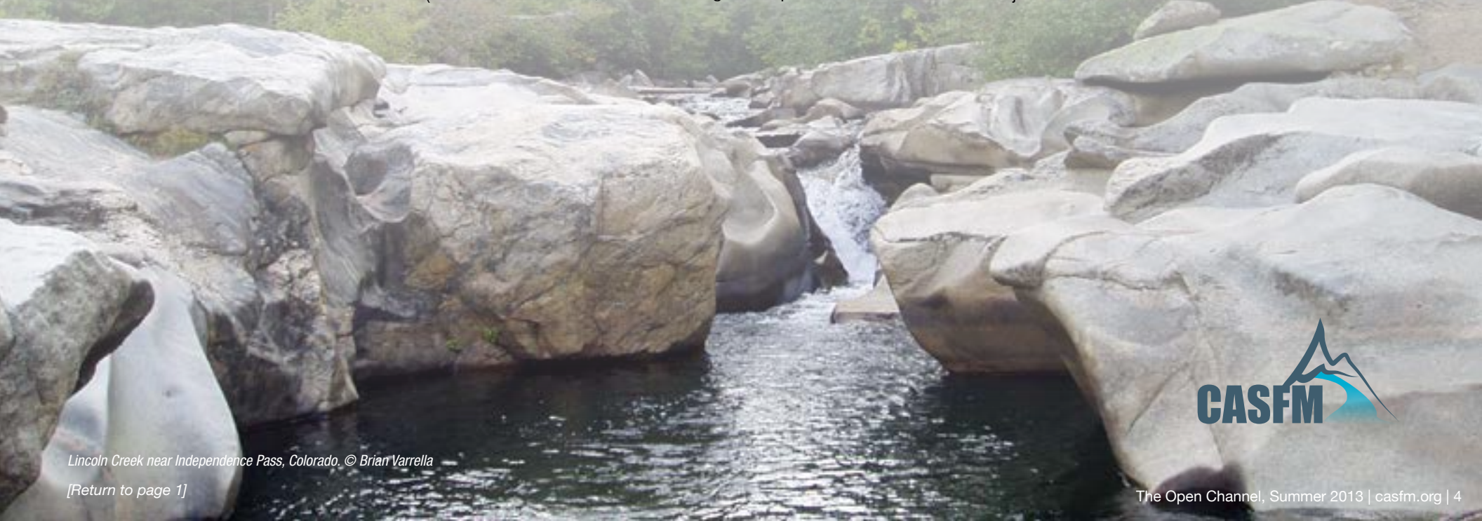
Lincoln Creek near Independence Pass, Colorado.

You will receive 12 continuing education credits (CECs) toward your Certified Floodplain Manager (CFM) credential for attending the conference. Please visit www.CASFM.org for conference updates and conference registration. Remember to register early for the lowest rates. We are excited about this year's conference and hope that you can join us!