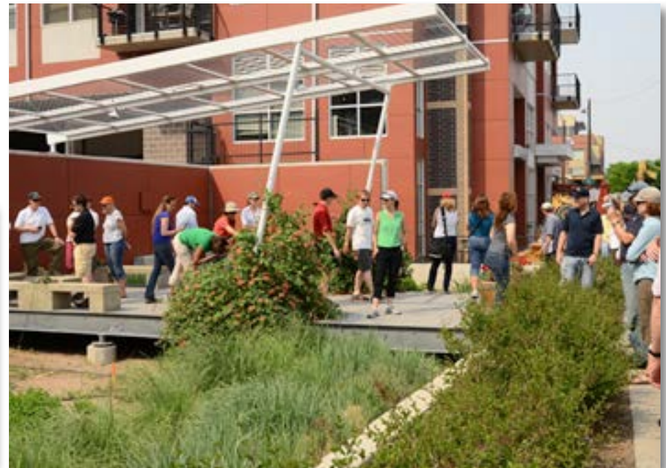
Rain garden at Highland Bridge Lofts.