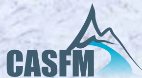
Nature's water storage at Copper Mountain