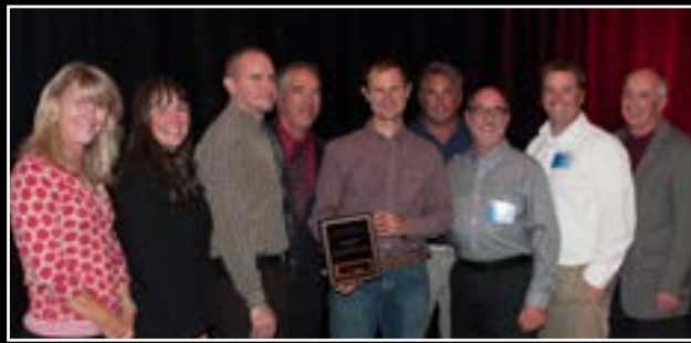
Canal Importation Ponds and Outfall project award team