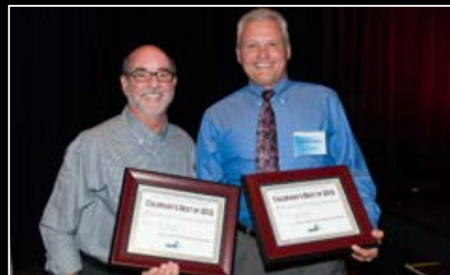
Lykins Gulch Stream Restoration project award team