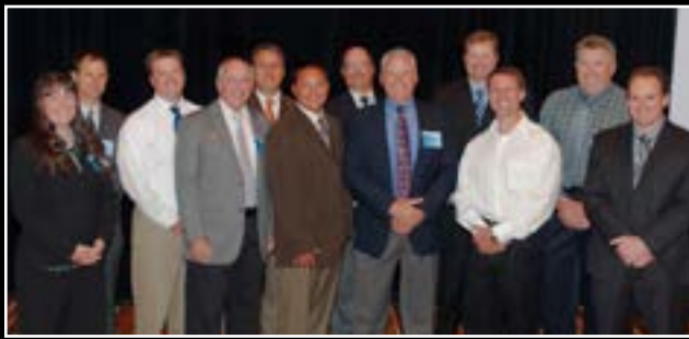
CASFM Project Award Finalists 2012