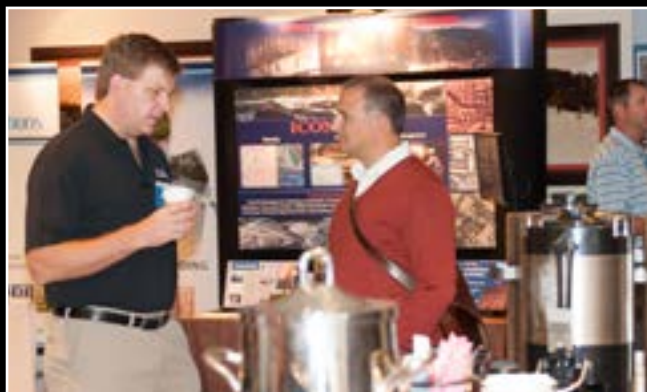
One of many vendor booths at the Conference located in the hallways between presentation rooms

I hope to see you all again next year—same place, two weeks earlier!