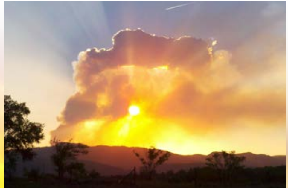
High Park Fire as seen from south Fort Collins, June 2012.

Save the date for the next field trip; Wednesday, June 12, 2013. The theme for the Stormwater Quality field trip in 2013 will be filtration BMPs. We are currently looking for sites to include. If you worked on or know of a rain garden or sand filter that might provide a meaningful stop on the 2013 tour please contact me at hpiza@udfcd.org .