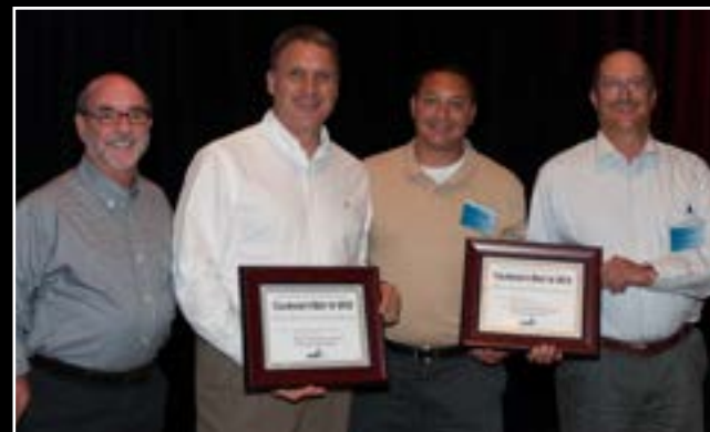
West Corridor Fastracks project award team