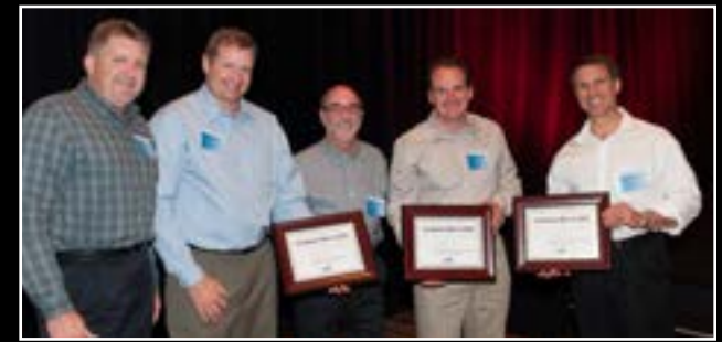
South Platte and Lower Lakewood Gulch project award team