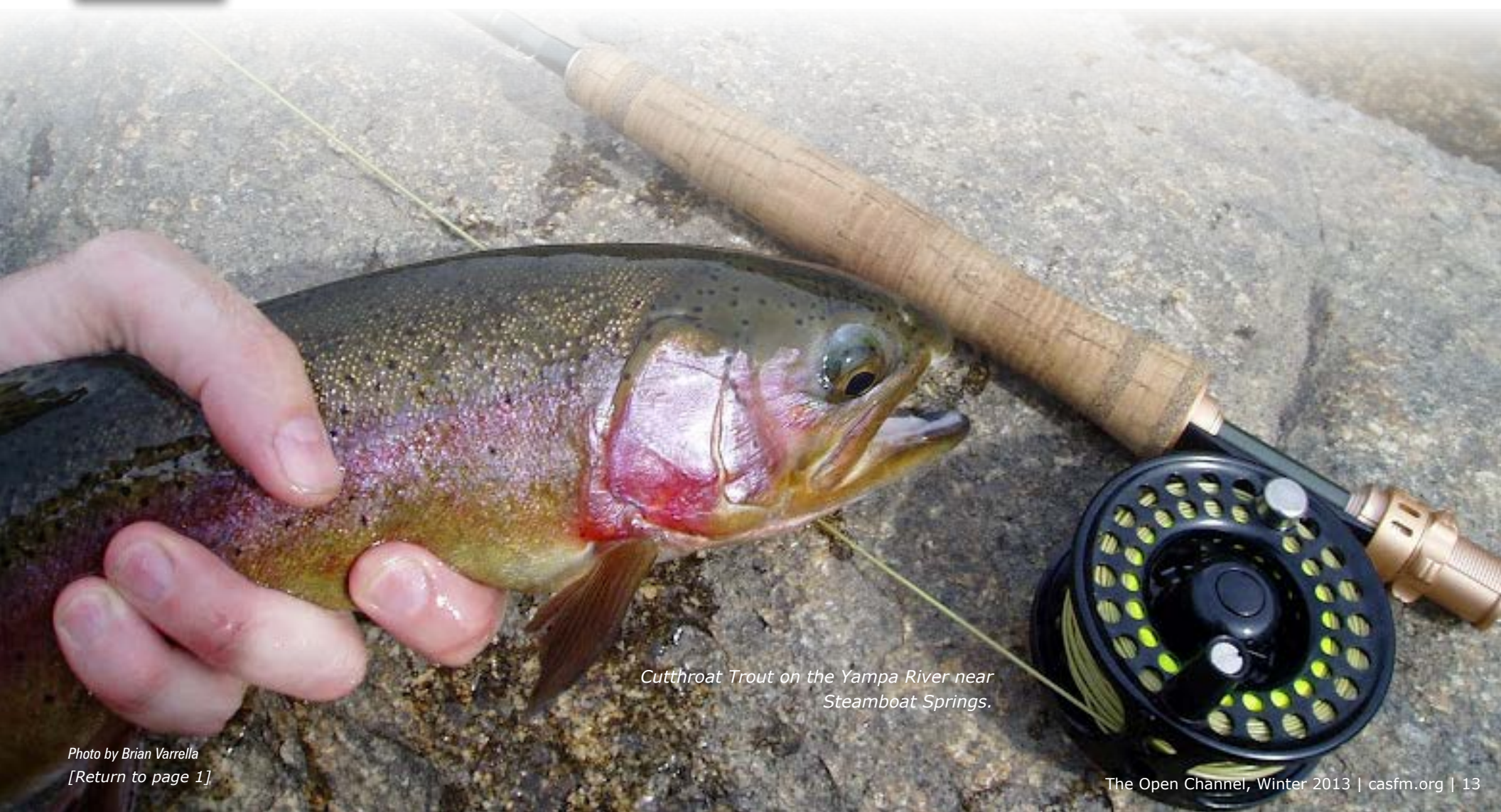
Cutthroat Trout on the Yampa River near Steamboat Springs.

We anxiously await the preliminary Digital Flood Insurance Rate Maps (DFIRMs) for El Paso County which are due out for review in September of 2013. We are also currently developing a public access web tool for citizens to be able to view their parcel and structure location with a floodplain overlay based on our GIS digitized floodplain layers.